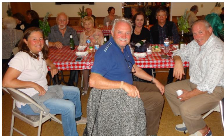
Happy party-goers. See the newsletter in color on our website!