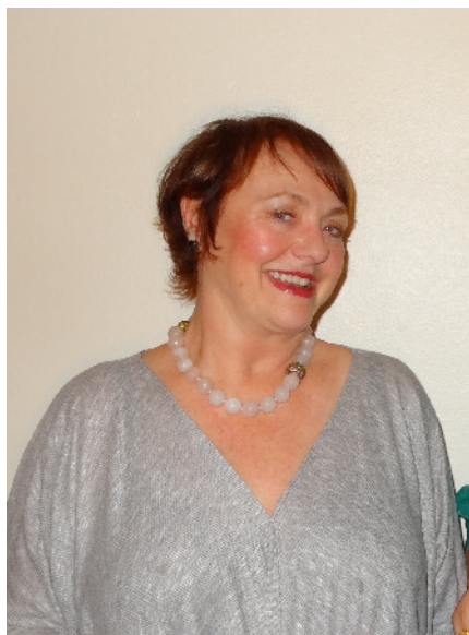
Our "Italia Evening." Ein schönes Lächeln, nicht?