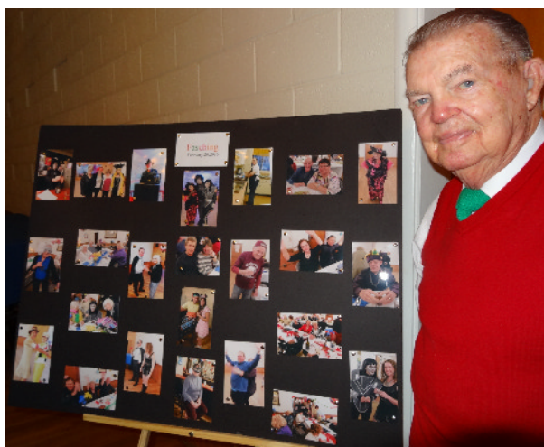
The creator stands by his photo display.