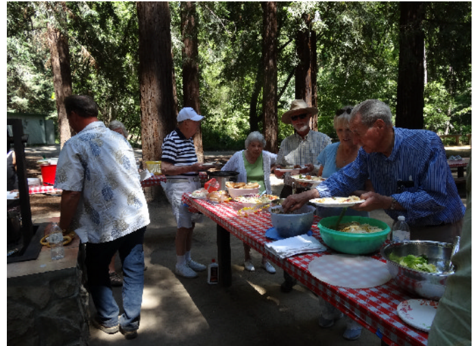
Great BBQ food