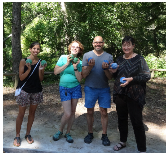
(r) Bocce ball battle!