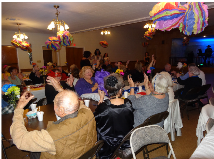
The audience in the music mood.