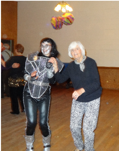
More "unusual" couples enjoying the dance floor.