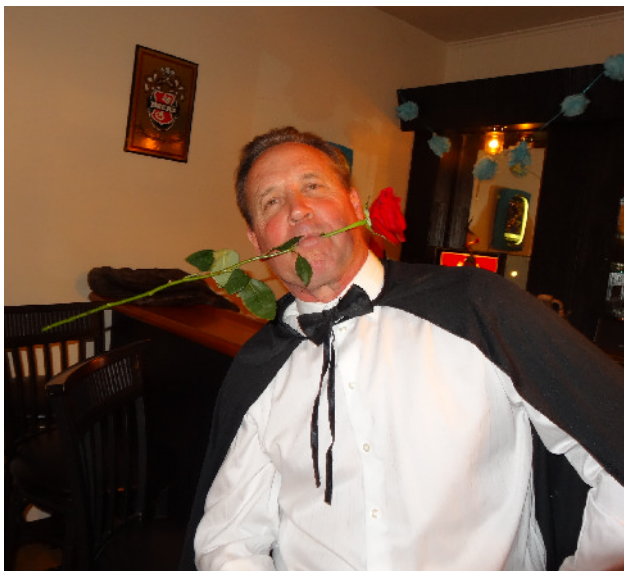
Dracula with blood rose firmly between his teeth.

REMEMBER: To see it all in color go to: www.germanamericanclubsantacruz.com